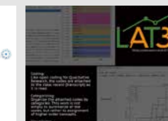
Education × DX